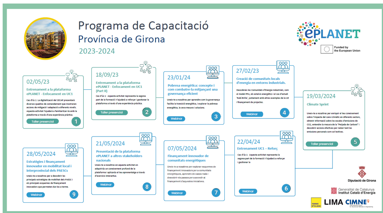
Figure 2: ePLANET Capacity Building Programme Activities deployed in Girona region